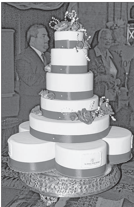
Sisters of the Incarnate Word and Blessed Sacrament were presented with a cake to celebrate the 160th anniversary of their arrival in Brownsville.