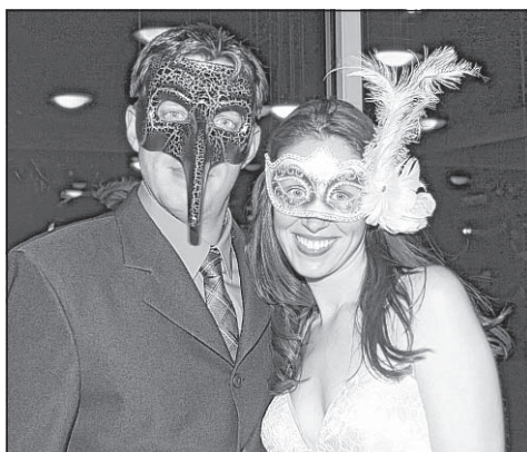
IWA Benefit Gala guests